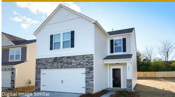
Digital Image Similar