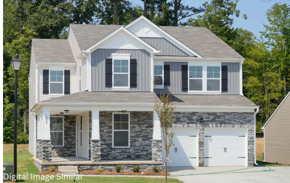
Digital Image Similar