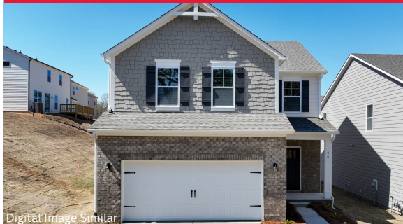
Digital Image Similar