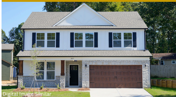
Digital Image Similar