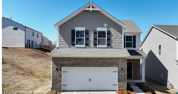
Digital Image Similar