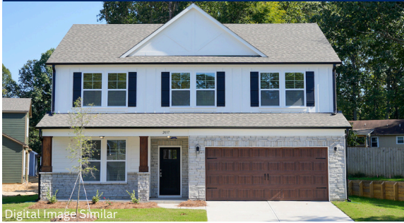
Digital Image Similar