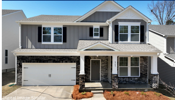
Digital Image Similar