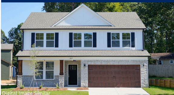
Digital Image Similar