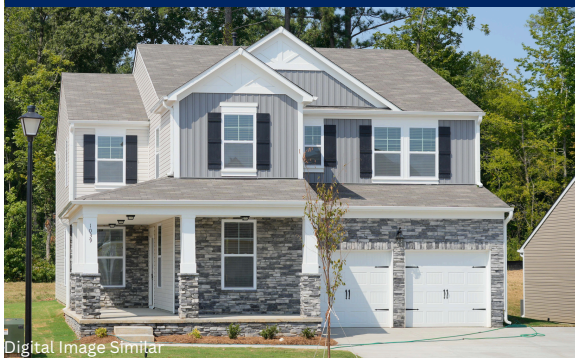
Digital Image Similar