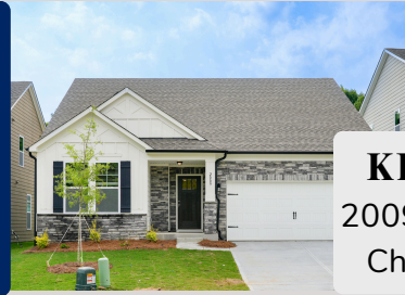
*PBR on Main Palmetto 2268sf

KH13 - $499,455 2009 White Cypress Ct. Charlotte, NC 28216